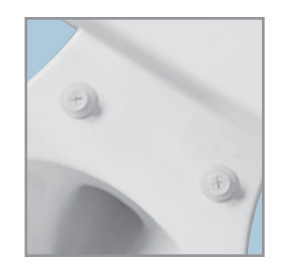
EASY REMOVAL OF SEAT FOR THOROUGH CLEANING